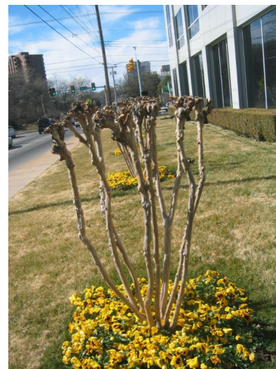
Stubs forming from cuts in previous years.

The practice of chopping off the tops of crepe myrtles at this time of year has become very common in Oklahoma. We sometimes call it Crepe Murder at LawnAmerica, as it really hurts the look and health of the plant over time. Many folks believe this is necessary to promote flowering, but that is not necessarily the case. More often than not, it's something that some commercial maintenance companies tell you needs to be done, but really just gives them something to do in early winter. Pruning in late winter or early spring will stimulate vigorous new growth in spring, and may lead to slightly more blooms. However, they will bloom if pruning is not done.