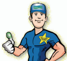
LawnAmerica Total Production 1999-2016

Much of our success can be attributed to the quality of people we have at LawnAmerica. We currently have a full-time staff of 60 great people. While far from perfect, we strive to be great at what we do, and enjoy doing it! We often work in teams in serving our customers. The better job we do at pleasing our customers, growing, and being profitable, the more our team members are rewarded with incentives and profit sharing. We realize that people like to work with nice, friendly, professional, and caring people, so that's part of what we look for in hiring new team members.